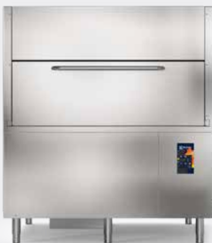
► PPE-L Personal Protective Equipment washer - large