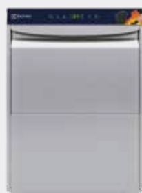
► PPE-UC Personal Protective Equipment undercounter washer

This special solution washes personal protective equipments in steel, composite, rubber, fabric, plastic etc. from oily substances, residue of combustion gases, toxins and other highly hazardous substances