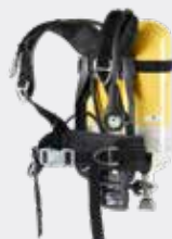
SCBA - self contained breathing apparatus